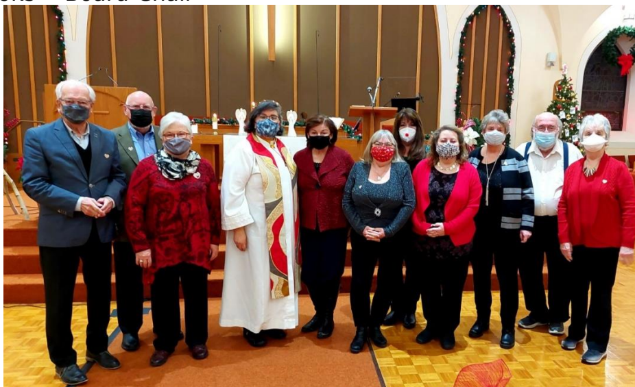
Christmas Eve Service participants